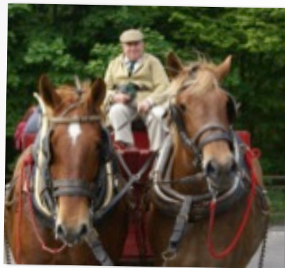
HORSE & CART RIDE